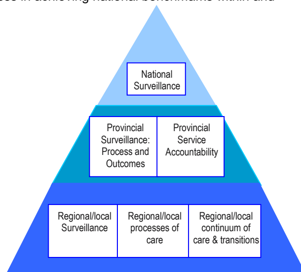
Figure 1: Hierarchy of Stroke Performance Priorities

This group has developed a quality framework that identifies the stroke best practices, HSF supporting services and mechanisms, internal and external partnerships and collaborations, and stroke data monitoring activities. This framework was approved at a Stroke Quality Summit held in December 2013, and included 45 stroke experts and quality of care leaders from across Canada. The quality framework and goals of this group are operationalized through the development of a core set of stroke performance measures and quality indicators, a standardized set of case definitions for stroke care, a repository of additional recommendation-specific quality indicators, audit tools, data collection tools in collaboration with the Canadian Institute for Health Information (CIHI), and the CSBPR performance measurement manual.