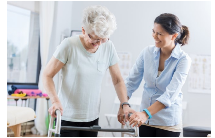
Rehabilitation Intensity Element 1 I was assessing, monitoring, guiding or treating the patient face-to-face.

NO. Therapists and organizations do not need to calculate the 33% . ALL rehabilitation intensity minutes provided by therapists and therapist assistants should be included in data entry and data reporting to the NRS.