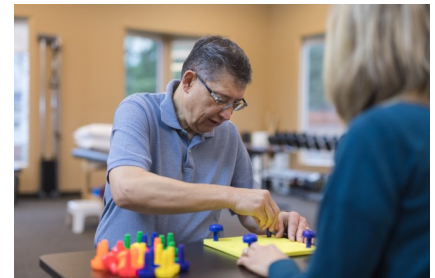
Rehabilitation Intensity Element 3 The patient was actively engaged in the activity throughout the session.