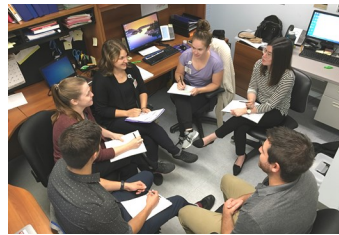
GMH team during their RI Huddle Examples of these strategies include:

identified 90 min/day as an incremental step towards achieving the provincial target of 180 min/day. When a patient's RI is not meeting this incremental goal, the team identifies ways to increase intensity.